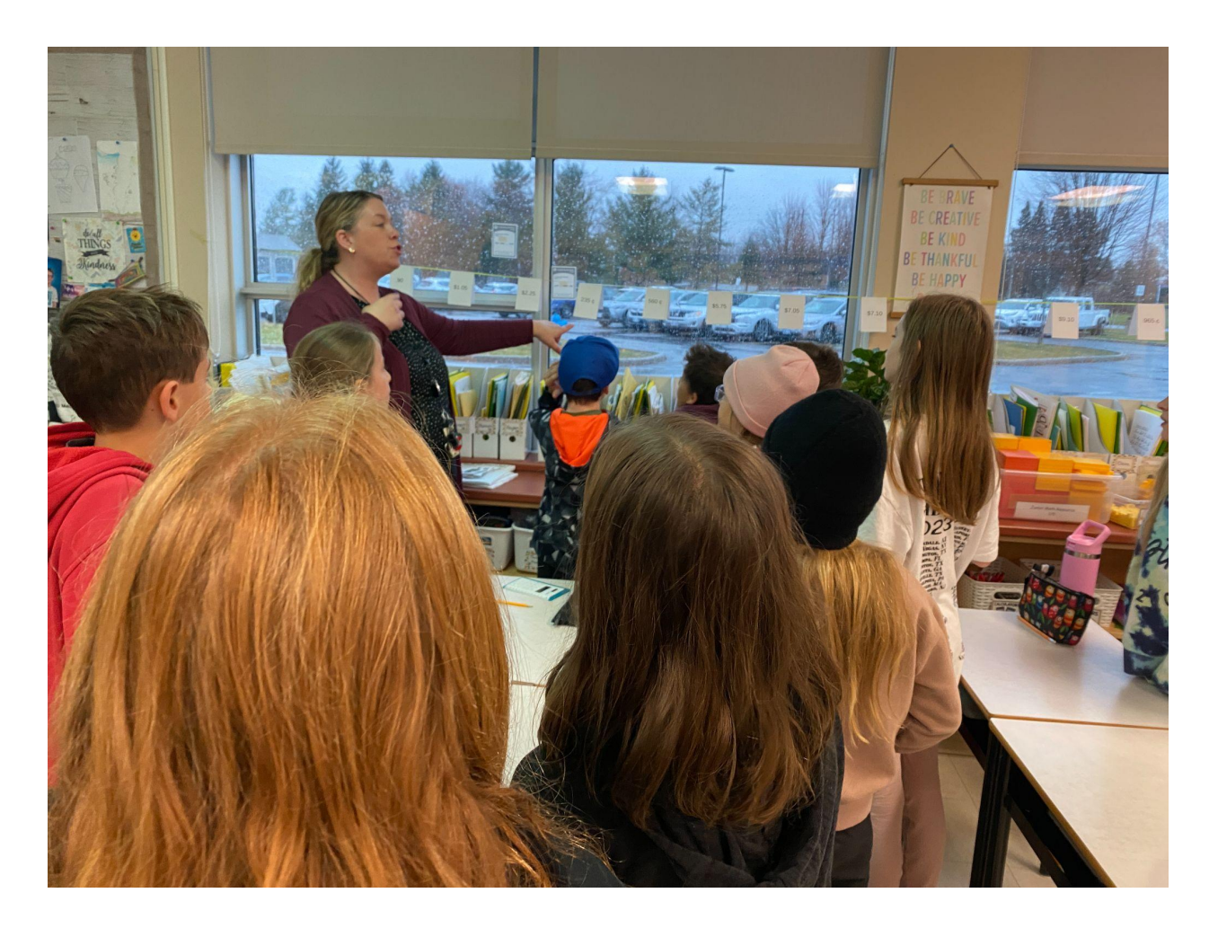
Grade 4 students use various tools to show their conceptual understanding of fractions, using number lines and concept circles.